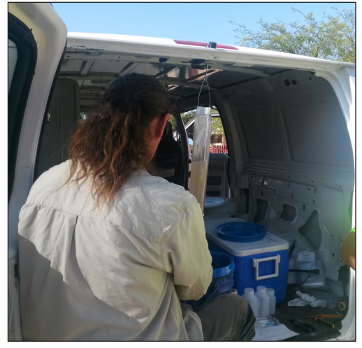
Sampling at Formerly Used Defense Site

The optimization is not just about reductions in effort but may involve the increase in effort or cost to assure protectiveness. The goal is to collect only the data needed to make operational and closure decisions, not more, not less.